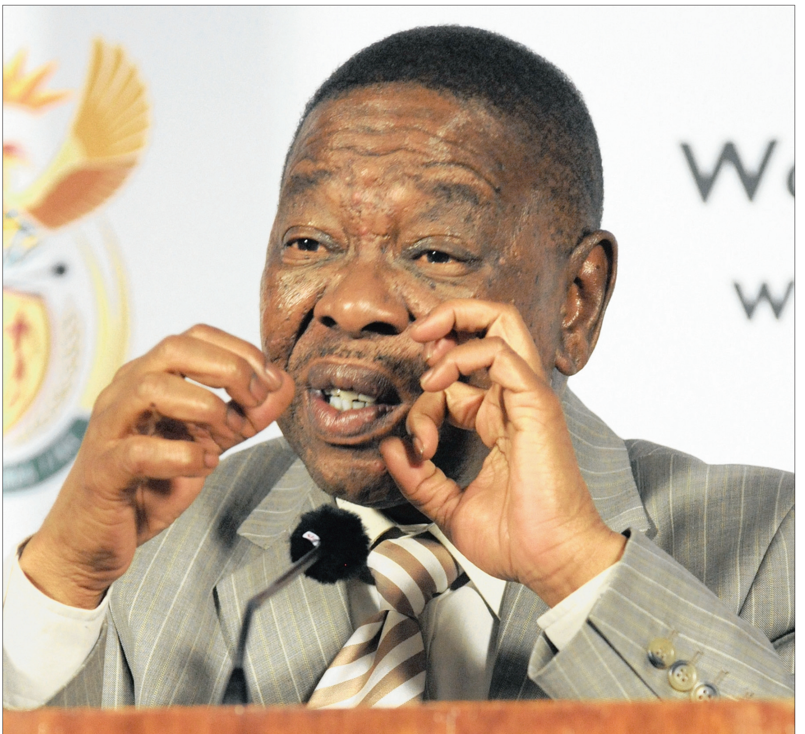
Minister of Higher Education and Training, Blade Nzimande, at a media briefing on the Mandela Day Career Guidance Campaign.

If they allowed their agents to operate clandestinely in another state, this would "complicate relations" with that state, as "those activities may very well border on subverting security and stability".