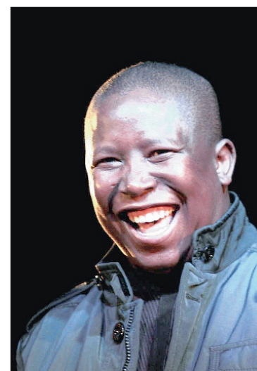
ANC Youth League leader Julius Malema addresses music enthusiasts at the Alexander Theatre yesterday.

Malema also told the young musicians they should use music to convey a political message.